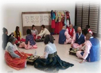
Korean culture experience